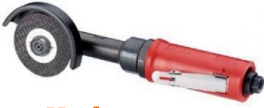
Long-Neck Cut-Off Tools