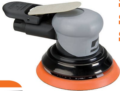
Silver Supreme Sanders